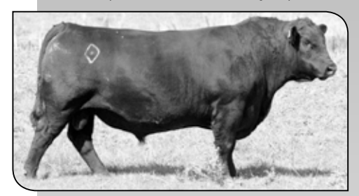
Turihaua Bullion A181 S: Turihaua Campbell D: Turihaua T160 DOB: 21/ BW+4.9, M +6, 200D +30, 400W +56, 600W +82 DOB: 21/08/05 Bullion is by the great old sire Turihaua Campbell. Campbell is still making an impact and has 27 yearling bulls for sale at the Schaff Angus Valley Annual Production Sale in North Dakota, USA this February. Like Campbell, Bullions progeny are showing great style. 7 sons have sold and there are 38 daughters in the herd. His calving ease figure of -0.4 is well above the breed average. He has some excellent sons for sale this year.