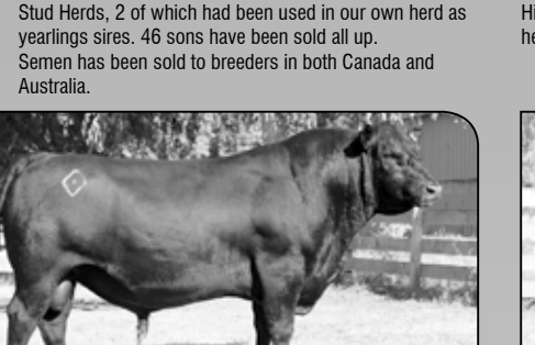
Turihaua Texan B141 (ET) D: Turihaua P43 DOB: 07/08/06 S: Hingaia Tex 121 BW +4.5. M +8. 200D +29. 400W +52. 600W +75 Texan's dam Turihaua P43 produced many ET calves. Texan has a very even spread of EBV's, has a moderate frame with plenty of constitution and muscle and a great temperament. His 1st crop of calves are well above weight expectation.

Turihaua Crumble Y167 S: Turihaua Gambo D: Turihaua W275 DOB: 11/08/03 BW +4.4, M +12, 200D +35, 400W +75,600W +95 This explosive sire has been leaving very impressive progeny both male and female. From the 215 born, 65 daughters are in the herd and 7 sons have been sold to Stud Herds, 2 of which had been used in our own herd as