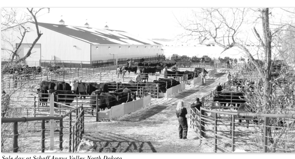
Sale day at Schaff Angus Valley North Dakota

27 Campbell sons sold for $8731 average, with a top price of $25,000. 6 females sold for $5333 average. Kelly spoke very highly of the Campbell progeny and is especially excited about the females that he has retained in the herd.