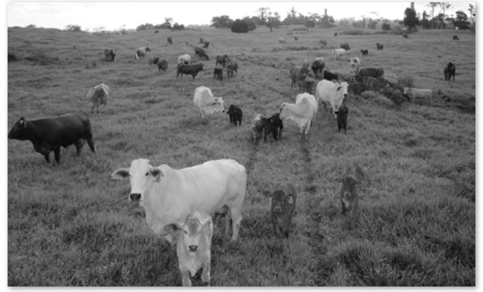
A heard of cows and calves in Vanuatu

In general the calves came through very well. The average daily weight gain was for heifers 0.68kg per day and for bulls 0.90kg per day.