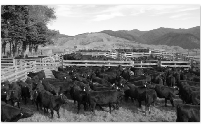
Yard weaning at Four Gates

It will be exciting to follow this project through and learn how our stock will fare in the tropics.