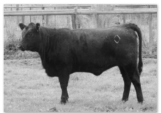
Queen of Hearts Turihaua F17

Revolution was sold to Kenhardt Angus Stud back in 2002 for $21,000.00. Turihaua V256 has produced over 40 embryos, 20 of