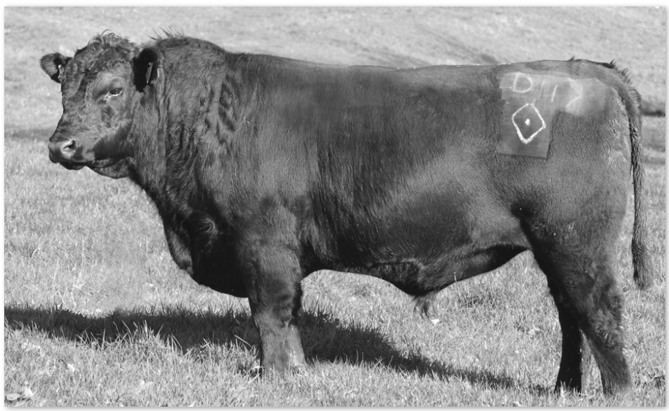
Turihaua Universal D117 sold to Farfield Stud for $31,000

We hope they have performed their sire duties and that your PD results are all positive.