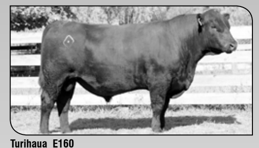
S: Turihaua Bullion A181 D: Turihaua U30 DOB: 14/08/09 BW +3.5, M +11, 200D +33, 400 +58, 600W +83 A very correct stylish Bullion son with well balanced EBVs. He has been used in our programme. E160 weaned at 123% ranking him 2nd in the year group.