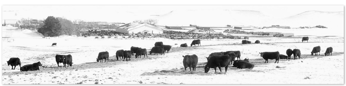
Cows feeding at Schaff Angus Valley on sale day