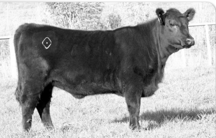
Turihaua Kathleen F17 (ET) S: Turihaua Revolution V237 D: Turihaua V256

We entered Turihaua Kathleen F17 into this new competition and sale. Although she was not placed she sold to Cricklewood Stud for $9,000.