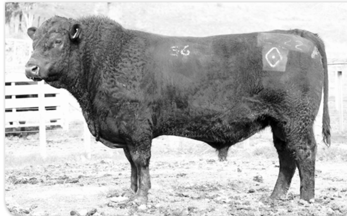
Turihaua Sir Crumble E222 S: Turihaua Crumble Y167 D: Turihaua W112