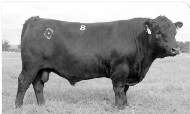
Turihaua Format E231 (ET) S: Turihaua Foreman B235 D: Turihaua X131