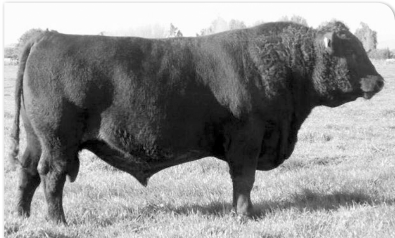
Turihaua Crump E5 (ET) S: Turihaua Crumble Y167 D: Turihaua Q263