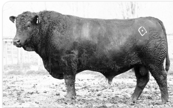
Turihaua Theodore E29 S: Waiteremui Theo C102 D: Turihaua C128

Bulls sold from Northland to Gore in the south.