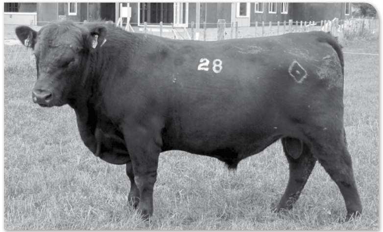
Turihaua Nation J126 Sire: Turihaua Liberation Dam: Turihaua A147

Turihaua Fracture J316 has a very strong Turihaua pedigree. Having Turihaua Campbell twice, Turihaua Crumble Y167 and Hingaia 121 in his bloodlines gives him reliability in structural soundness, constitution and a proven ability to breed. A top son by Turihaua Break D92. He is a well balanced easy doing bull with a great nature.