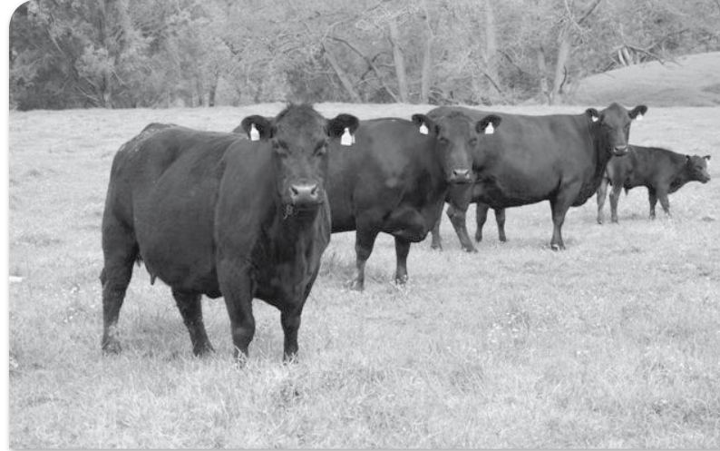
Turihaua Donor Cows

Angus,” a massive statement considering the amount of sires to be put under the hammer over the last 100 years. Turihaua H34 was sold to Red Oak Angus for $10000, while the remainder of the 73 bulls sold commercially for an average of $8034. Popular bloodlines were Turihaua Foreman, Turihaua Rex, Turihaua Liberation and Waitangi Kai.