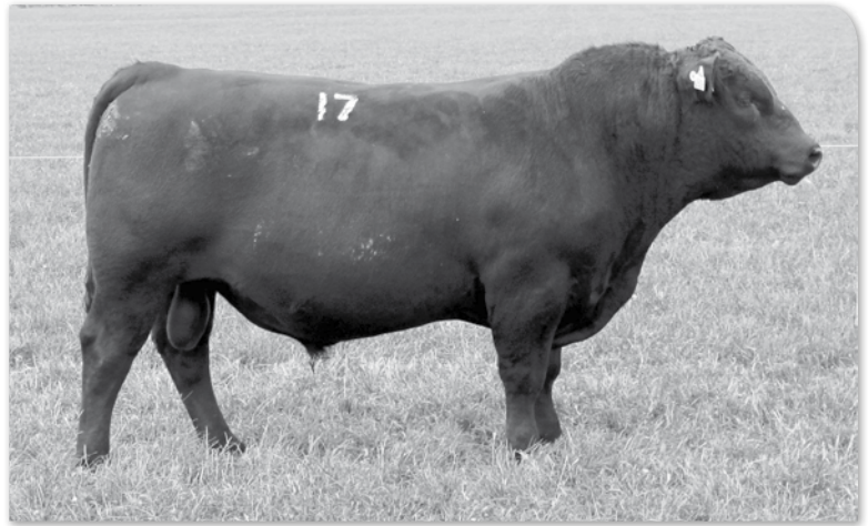
Turihaua Fracture J316 Sire: Turihaua Break D92 Dam: Turihaua F302