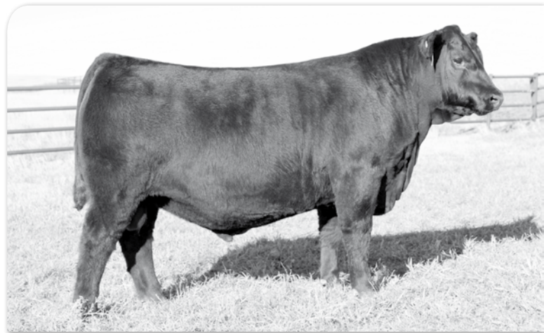
SAV Copyright 0194 (USA) Sire: Turihaua Campbell Q197 Dam: SAV Madame Pride 4466