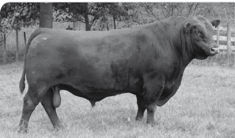
Tangihau Regal 117 Sire: Ranui 4716 Dam: Tangihau 103458