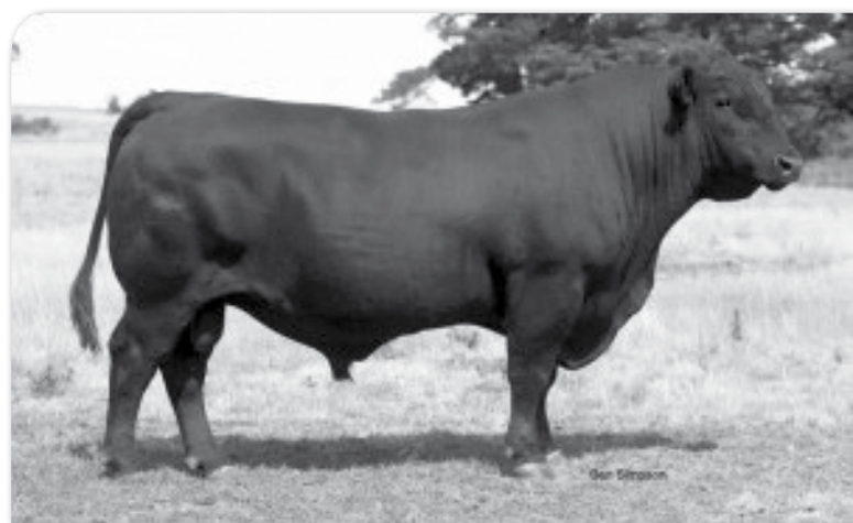
Irelands Galaxy G43 (AUS) Sire: Irelands Detroit D2 Dam: Irelands Pleaseure C4

An outstanding bull who combines superb phenotype and exceptional raw data. Galaxy provides an outcross for us and New Zealand and has real strength of pedigree to confirm his performance. ♦