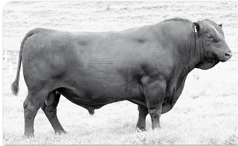
Turihaua Liberation C27 Sire: Turihaua Libell A48 Dam: Turihaua A278