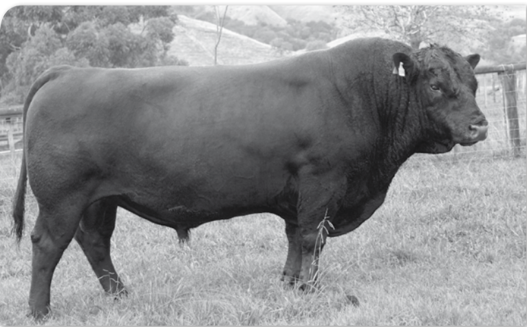
Turihaua Break D92 Sire: Turihaua Crumble Y176 Dam: Turihaua U170