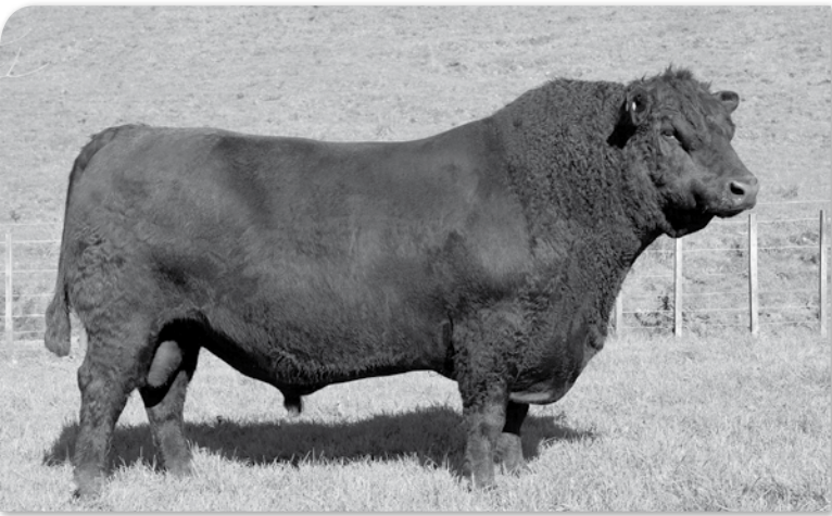
Turihaua Rex E297 Sire: Turihaua Texan B141 Dam: Turihaua B48