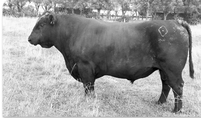
Turihaua Legend H142

His dam Turihaua E158 is a beautiful cow who continues to wean great calves.