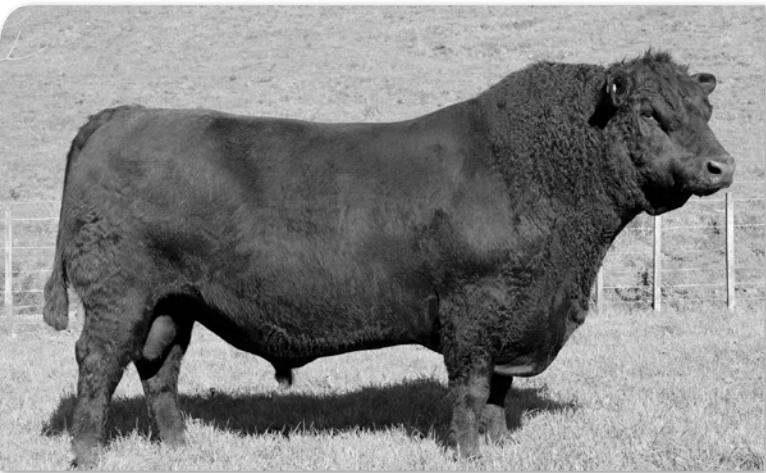
Turihaua Rex E297 Sire: Turihaua Texan B141 Dam: Turihaua B48