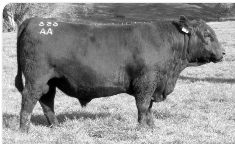
Alpine Double Charge 656 Sire: Alpine Double Charge 316 Dam: Alpine Legacy 429