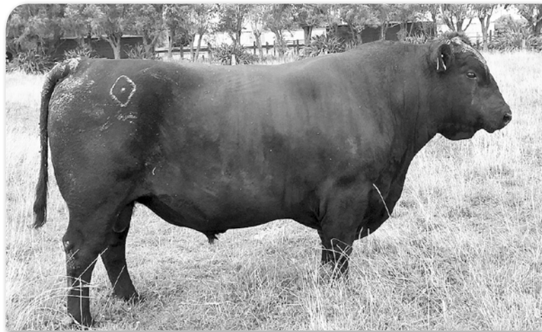
Turihaua Legend H142 Sire: Turihaua Liberation C27 Dam: Turihaua E158