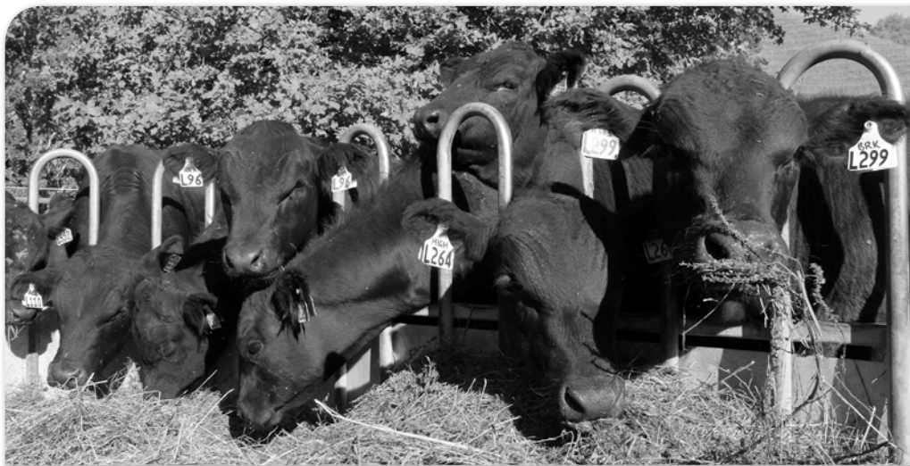
Yard weaning bull calves in February