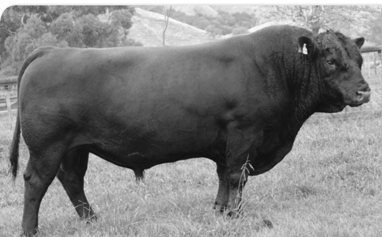
Turihaua Break D92 Sire: Turihaua Crumble Y176 Dam: Turihaua U170