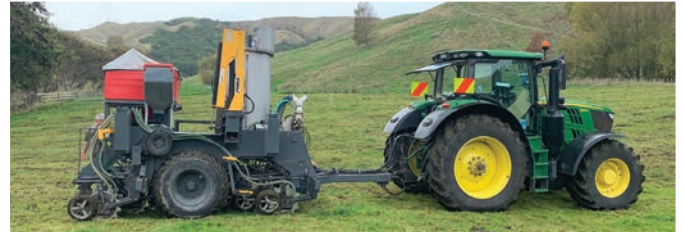
The cross slot direct drill is applying various seeds combined with living fungi and bacteria strains