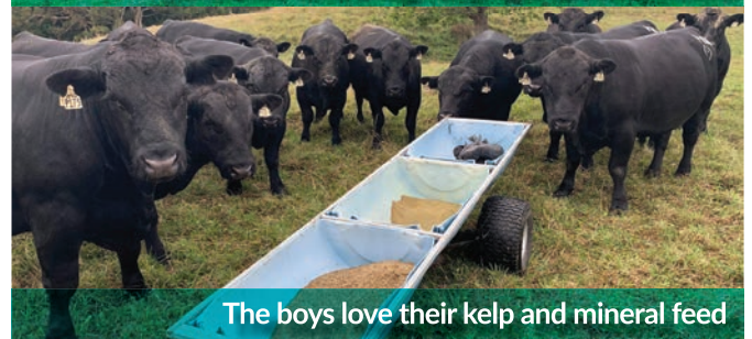
The boys love their kelp and mineral feed

flying it on by fixed wing. This year we have applied 2.2kg/ha of three clovers, plantain, chicory and lucerne, over the whole property (1000ha).